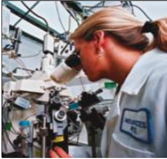
isolated for the first time, the clear channel gene causes lab rats to buy each other at an alarming rate