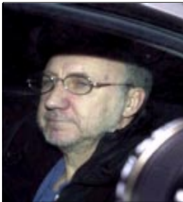
"wish I'd died before I got old