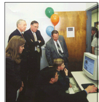
Sen Hatch celebrates the 1st computer to be destroyed