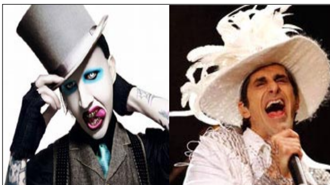
two of the leaders of the silly hat revolution